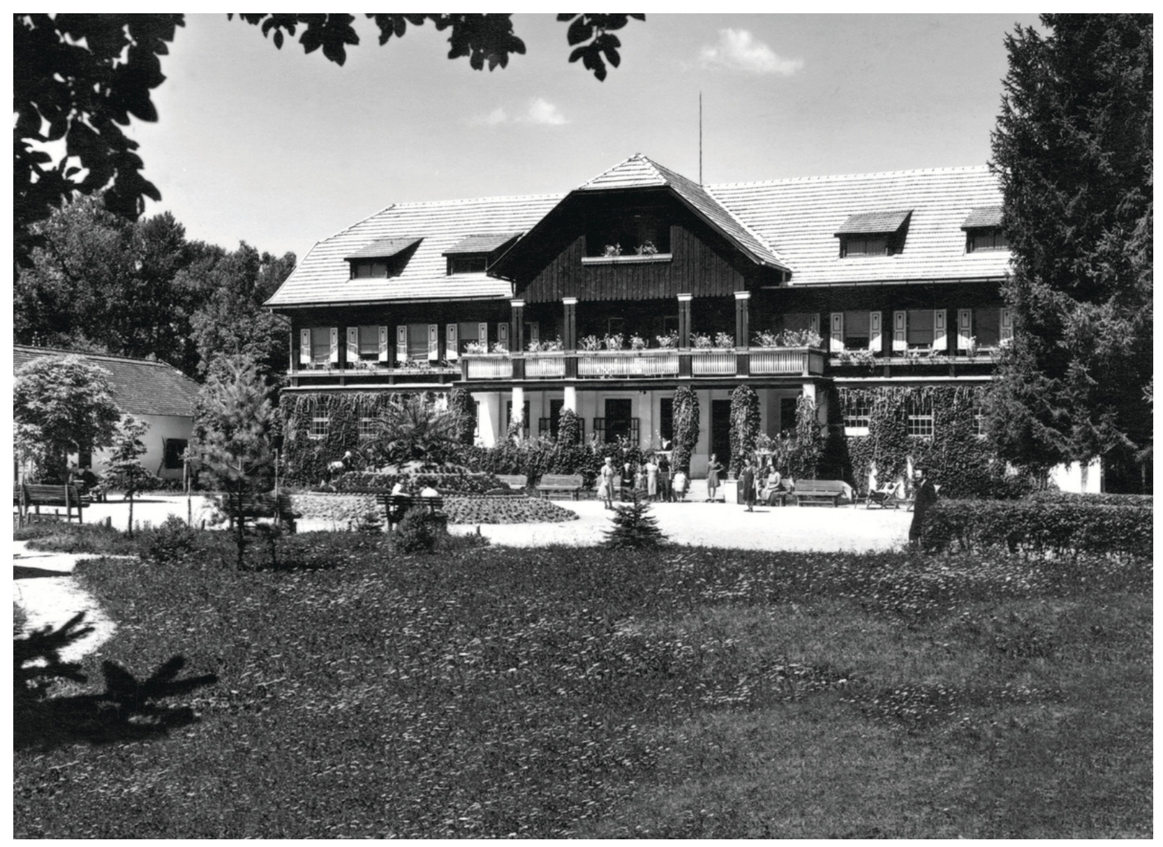
Let's go to Terme Čatež - TO CELEBRATE! Summer Thermal Riviera | Saturday, June 21<sup>st</sup> 2025