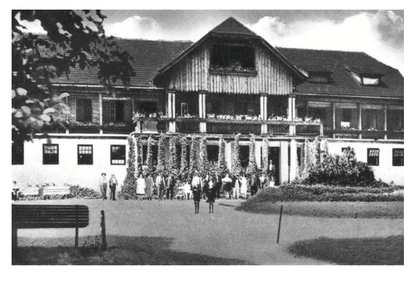
Photographs are kept in the museum Posavski muzej Brežice & library Knjižnica Brežice